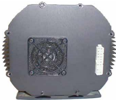
Power Connector End Panel