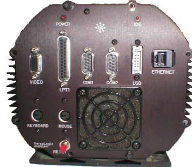
I/O Connector End Panel